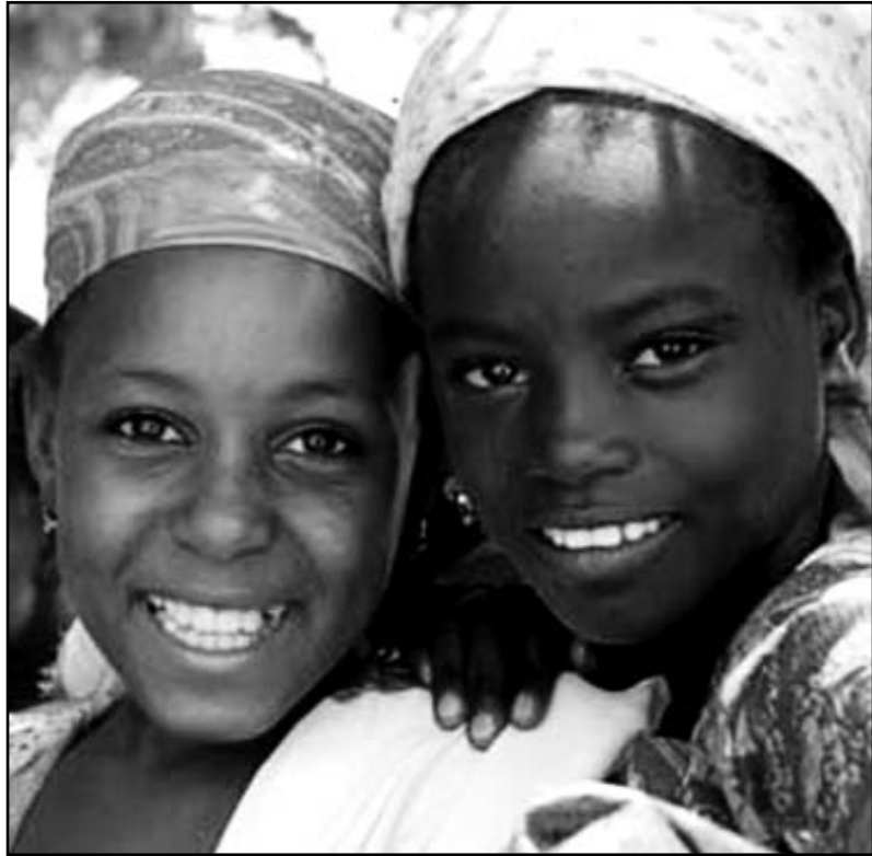
C. HamWorld Vision

The African Child Policy Forum would like to express its gratitude to Plan International whose generous support has made possible the Second International Policy Conference on the African Child: Violence Against Girls in Africa, for which this report was prepared.